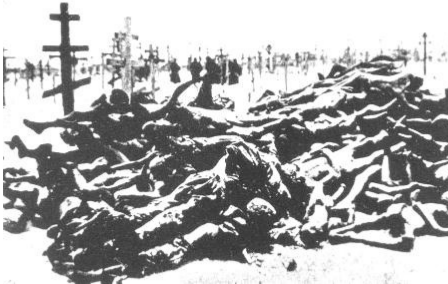
One of the countless mass graves of victims of the Ukrainian Genocide/Holodomor

A census taken in January 1937 was suppressed and the census board was shot as (in the words of an official communiqué) " a serpent's nest of traitors in the apparatus of Soviet statistics. " They had, Pravda stated, " exerted themselves to diminish the population of the Soviet Union. "